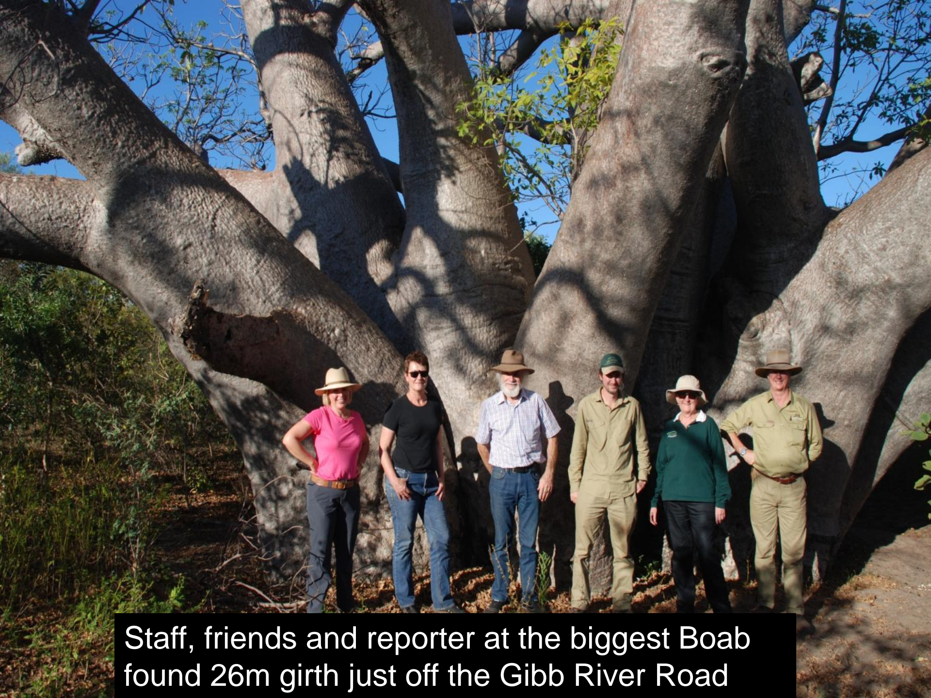
Staff, friends and reporter at the biggest Boab found 26m girth just off the Gibb River Road